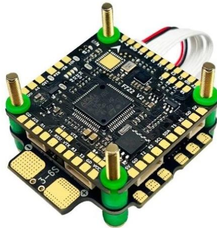
Fig.1. Pilotix F722 V2 AM32 60A

The F722 V2 AM32 60A from Pilotix is a flight controller and electronic speed controller (ESC) combination designed for FPV applications. It is powered by the STM32F722 microcontroller, supports Betaflight firmware, and features an analog OSD. This model operates with a 4 in 1 ESC configuration, providing a continuous current rating of 60A and peak current of 70A. It operates within an input voltage range of 3 to 6S, and supports multiple protocols including DShot300 and DShot600, with bi-directional DShot capability. The operating temperature range extends from -20°C to 40°C, while the storage temperature range is from -30°C to 50°C, accommodating a humidity range of 20-95% RH (noncondensing).